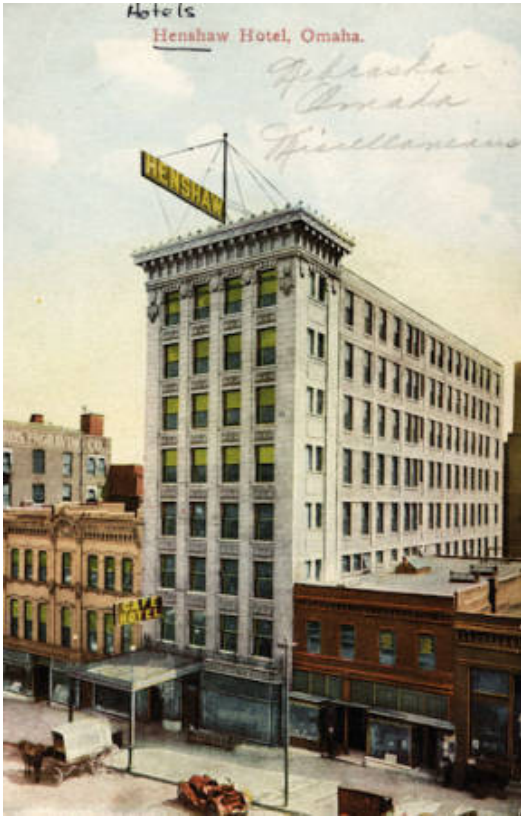
1908 Henshaw Hotel