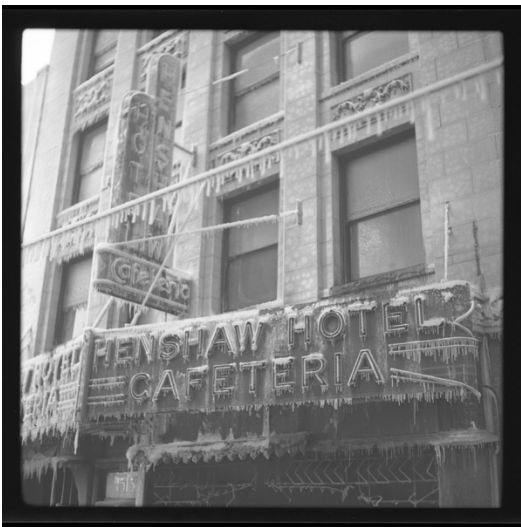
1940 Fire Damage