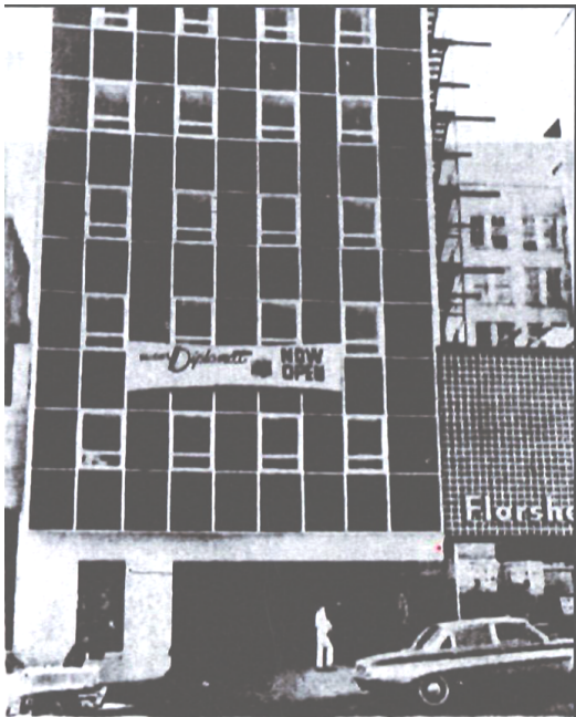
1960 Diplomat Hotel